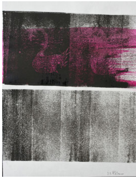
Untitled, 2012 oild on canvas, 30 x 40 cm,

Jörg Söchting is a German artist who lives and works in Berlin. The works on show are paintings and drawings from a series of works which the artist has entitled film noir. Söchting's paintings and drawings with their delicate layers of painting mixed with a printing technique remind the observer of overexposed film strips where figurative elements will stand out in the mostly abstract paintings and drawings.