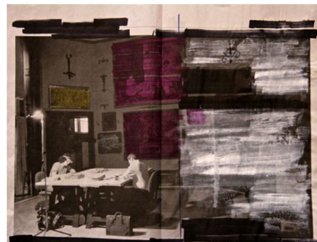
Schreibtisch, 2011 Marker and acrylic on newspaper, 29 x 39 cm