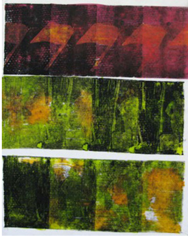
"(Mondphasen / Ereignisse I)", 2011 Oil on canvas, 50 x 40 cm