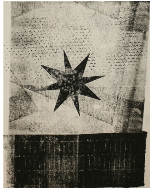
Untitled , Oil / print on paper, DIN A4