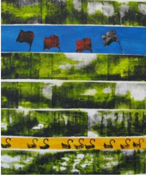
"Mondphasen / Ereignisse I" , 2011, Oil on canvas 130 x 110 cm