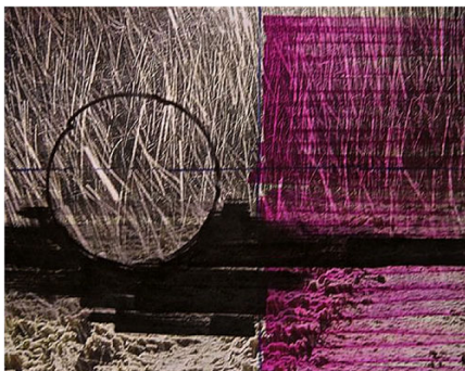
Schnee, 2011, Marker on paper, 14 x 17,5 cm