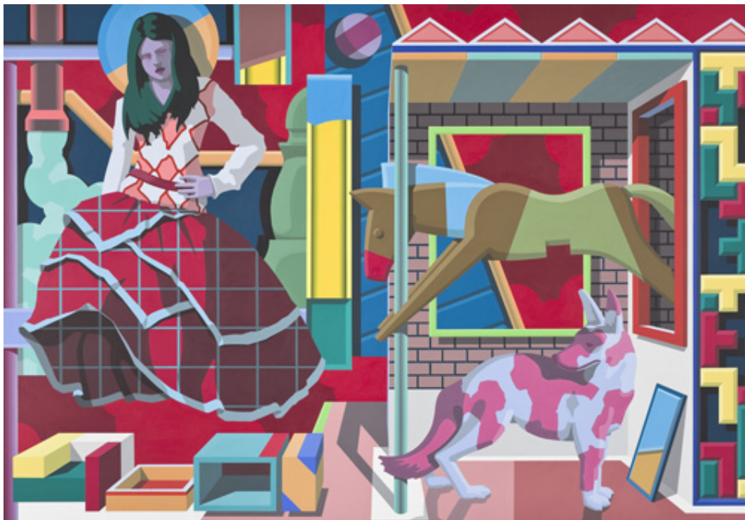
Untitled, 2012 Acrylic on wood, 140 x 200 cm

Gallery Bergman Berglind Contemporary Art 49, rue Baudouin L-1218 Luxembourg-Hollerich www.bergmanberglind.com