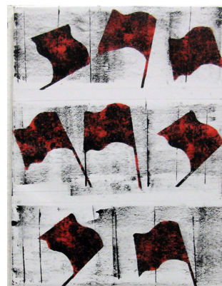
(SOS)Red Flags, 2012, oil on canvas, 60x50cm