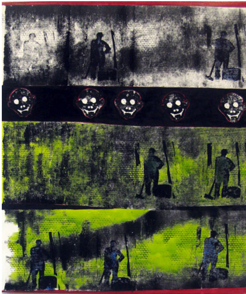
Ein Männlein steht im Walde ... , 2012, oil on canvas, 50x40cm