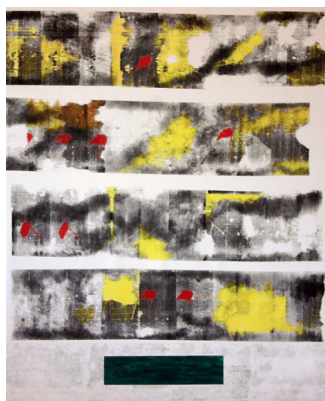
Satte Wiesen, 2012, oil on canvas, 165x135cm

He mainly uses canvas as basis for his artworks, but also other materials like paper, cardboard and wood. Printed motifs are placed side by side or in layers on top of each other. Besides the classical technique of oil painting with a brush he uses an oil printing technique and as well spray cans.