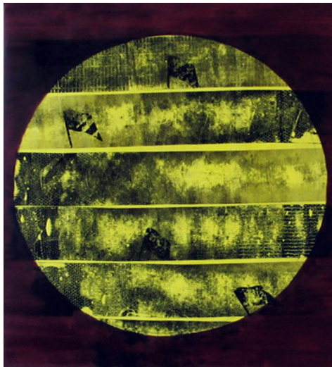
Nichtswirdwas II, 2012, oil on canvas, 80x70cm

At first sight the observer recognizes the work of Jörg Söchting as abstract compositions. Upon further consideration, however, a story is detected. This story emerges like from an old black and white film from the “film noir” era or a scene from a documentary of the first moon landing. The pictures also recall historical scenes of workers or their struggle, in which humans and flags stand out as symbols. Ultimately the observer discovers symbols and figures, which presents him or her with a challenge to interpret them as parts of their own history and actions.