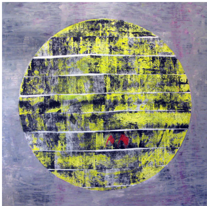
Nichtswirdwas I, 2012, oil on canvas, 175x175cm